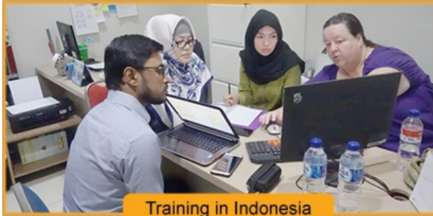
Training in Indonesia

To schedule training, users of Therap Asia are requested to call at +8801799872843 number or email us at infoasia@therapservices.net .