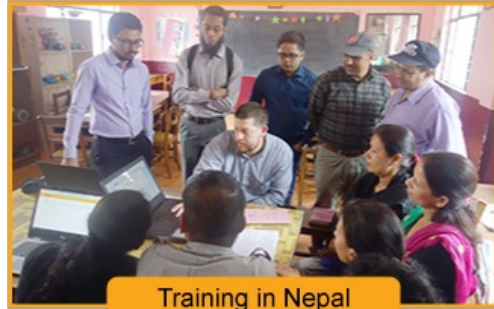
Training in Nepal